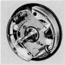
HEAVY DUTY TOTAL-CONTACT BRAKES

Dodge Pursuit brakes are 11" x 2½" floating-shoe type with Cyclebond linings—no rivets. Deliver 30% longer lining life, need 25% less pedal effort. No brake fade on sudden stops.